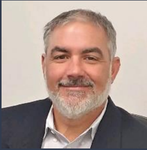
Manuel Abello Dement Construction Co.